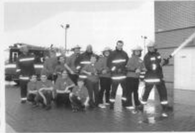
Some of the Gang Wash down the Auditorium ready for the show, with a team from HFB's White Watch

Remember that a smoke detector, fitted properly in your home, can save your life in the event of a fire. Make sure YOU have one