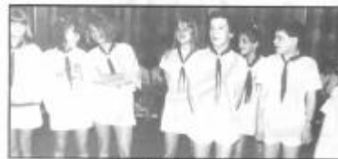
WHAT DO WE DO NEXT?