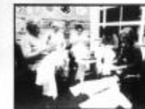
STILL BUSY BEES

MIDDLEPLATT ROAD, IMMINGHAM, S. HUMBERSIDE, DN40 1AH.