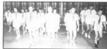
WEST FOOT FORWARD